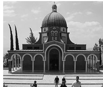
The Church of the Beatitudes by on the northern coast of the Sea of Galilee in Israel. The traditional spot where Jesus gave the Sermon on the Mount.

In each Beatitude, Jesus names a group of people normally thought to be not only unblessed, but not even worthy of a blessing, and pronounces them blessed (well-off and fortunate) because abundant life is available to everyone in God's kingdom, regardless of status, circumstances, or condition. Here the values of the world are turned upside down. Those who were fortunate to hear these words first hand, must have wondered what on earth Jesus was saying. After all, the people had been taught that wealth, power and status were outward signs of God's blessings and here Jesus is saying the opposite - blessed are those who are at the bottom of the heap, those whom the world ignores. In fact, Jesus was probably saying, "Blessed are you who are